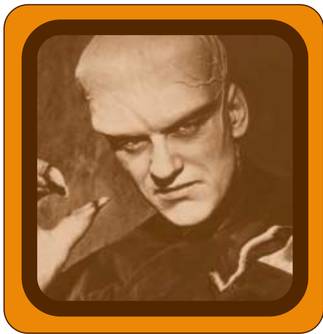
Left: Angry Young Cinema: The Original British New Wave: Julie Christie in DARING (1963) Right: Mad Max Series: THING FROM ANOTHER WORLD